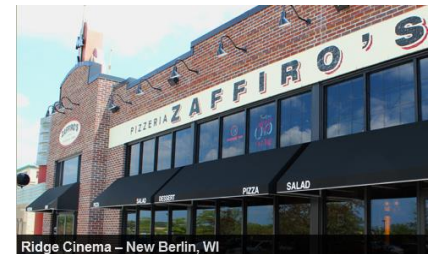
Ridge Cinema – New Berlin, WI