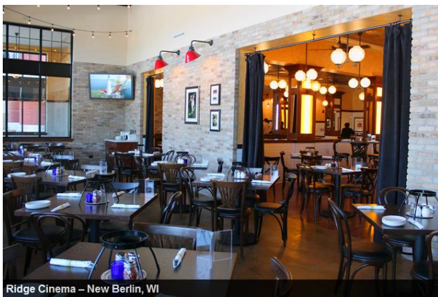
Ridge Cinema – New Berlin, WI